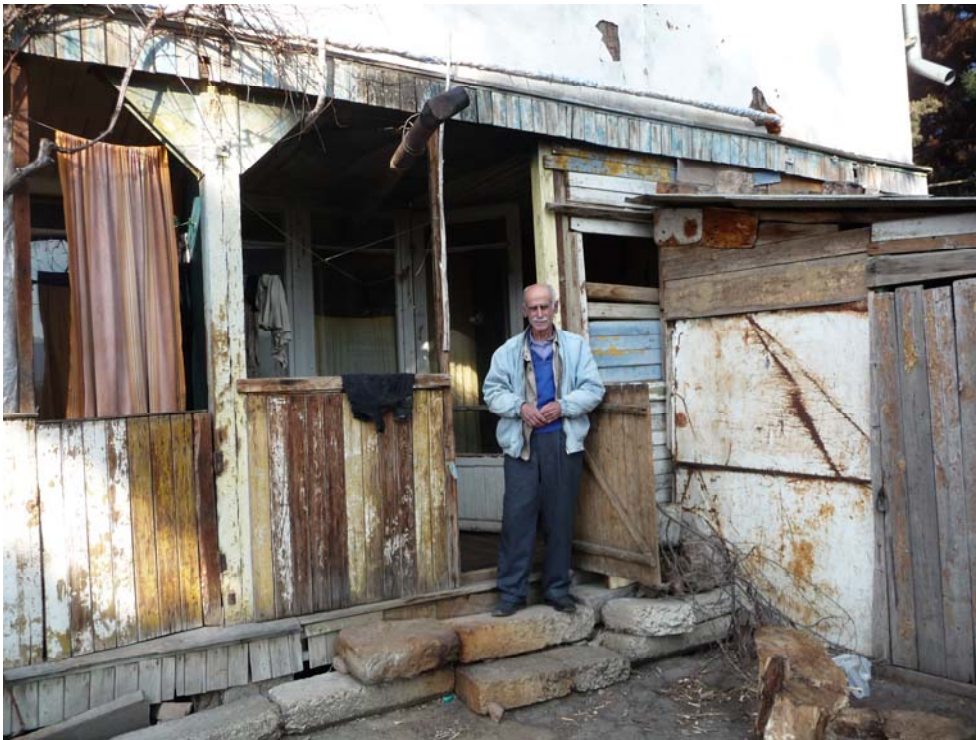
Elderly man in front of his accommodation at a collective centre near Gori (formerly a holiday camp).

The government's initiative to address the housing situation of displaced people in order to provide them with durable housing solutions is a positive initiative. However, this must be implemented in a manner which is consistent with the government's obligation to guarantee the right to adequate housing of all persons. The government needs to ensure that both old and new resettlement sites meet the criteria for adequacy of housing, under international law. It is particularly concerning that many displaced people have been living in buildings which were not designed to house people and that have lacked basic amenities for almost two decades. The government must also address the needs of displaced people living in or renting privately owned accommodation. It also has to ensure that the Action Plan is implemented in a non-discriminatory fashion and prioritises the most disadvantaged groups, while implementing housing solutions.