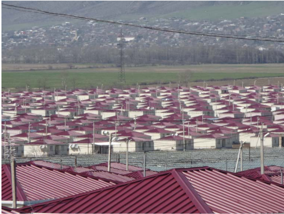
New settlement built by the government to house IDPs from the 2008 conflict near Tserovani.

During Amnesty International's visit to Tserovani and Tsilkani settlements in June 2009, residents complained that they had not been allocated any other agricultural land for cultivation, apart from the small parcel of land around their houses for kitchen gardens. Even in instances where they had been provided with agricultural land, it was of low quality for cultivation owing to a lack of available irrigation water and machinery. These factors have prevented many households from engaging in farming. 77 The biggest challenge cited by inhabitants, was the absence of employment opportunities, which made residents increasingly dependent on humanitarian aid or financial allowances.