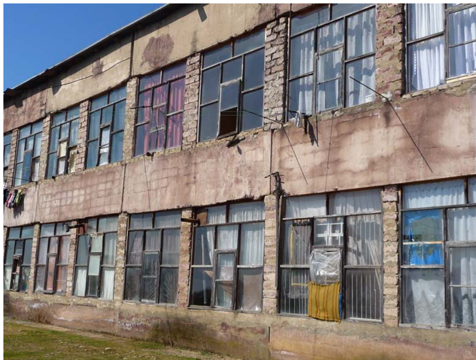
Collective centre in Zugdadi (a former printing works). People have been living here since they had to leave their homes in Abkhazia in the 1990's.