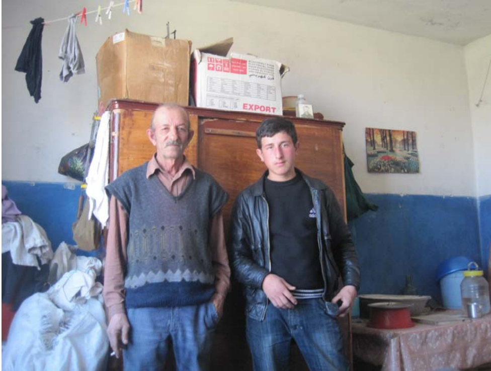
Father and son living in Zugdidi collective centre.