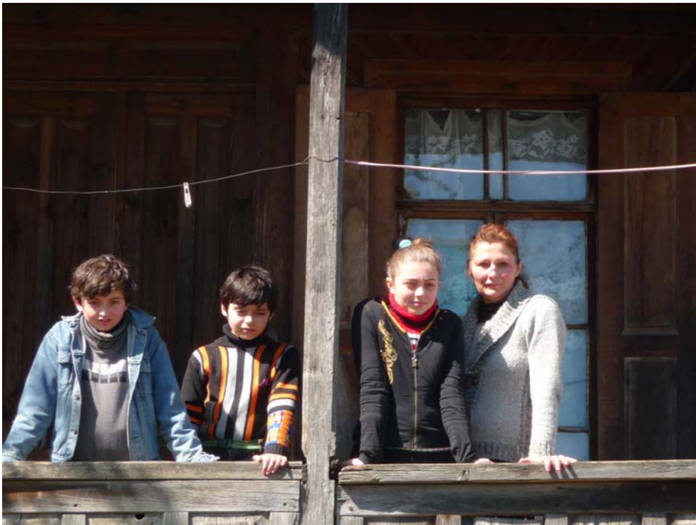
A family of IDPs living with relatives in Zugdidi.

This lack of information and awareness not only jeopardizes and delays the effectiveness of state programmes for displaced people but also deepens the isolation of IDP communities, and reinforces their dependence on the state. Without full knowledge of their rights, entitlements and options, displaced people will find it even harder to integrate into the rest of Georgian society.