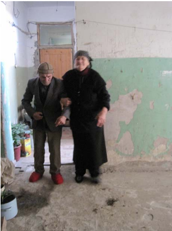
Elderly couple in a collective centre in Kutaisi.

Because of these barriers, displaced people are either left without care, or their families are pushed further into poverty. Financial constraints, lack of information and fear of unmanageable expenses also limit their willingness to seek healthcare until the critical moment. Even preventable diseases are rarely diagnosed quickly and treated adequately, resulting in serious consequences to the health of displaced people.