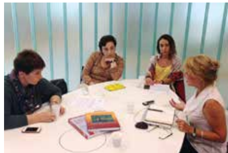
Study tour in Holland

In Holland doctors were familiarized with the work of three leading children’s hospices and home care service and have taken intensive study course in children’s palliative care.