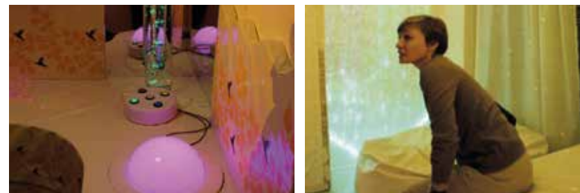
Maka Chichua First Lady at Children hospice in Germany

The curtain is used for eyesight stimulation. It improves tactility.