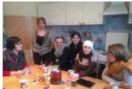
Our nurses in Belarus, Minsk

Doctors visited department of children’s palliative care at Nino Jesús University Hospital for children in Madrid, Spain and learned specificity of home care service.