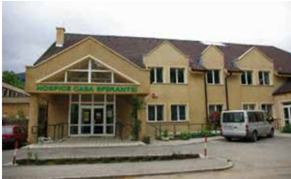
Hospice in Romania

In 2013 the doctors and in 2014 the nurses of our team participated in intensive two-week-study tour and qualification raising course at a hospice “Kasa Sperante” in Brasov, Romania.